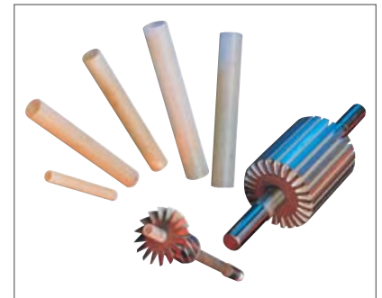
Polygon Tube® provides double insulation in high torque motor armatures.

"Leading the electrical industry for 60 years with over one billion tubes in production."