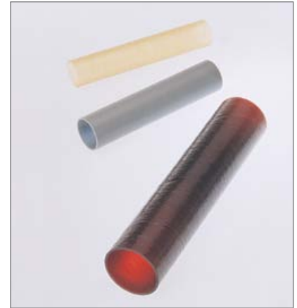
High temperature fuse tubing remains stable through prolonged heat.

**Note: These are typical properties. Specific properties may vary, depending on the composite design for each application