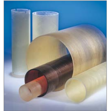
Available in a variety of standard and custom sizes.

"Filament winding, braiding, pultrusion and fabrication— all in one organization."