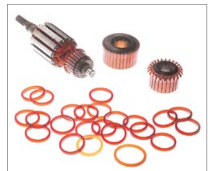
Provides insulation in high temperature motor applications.