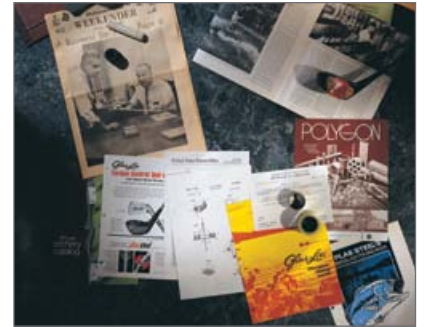
Polygon has a long history of providing electrical insulation products.

To ensure each double insulated Polygon Tube surpasses all electrical insulation requirements we have implemented an uncompromising inspection process. Each tube is tested at 5000 volts to guarantee its dielectric integrity. Polygon Tube carries approval by Underwriters' Laboratories, Inc. to grade AFW-G-10. Certification and SPC controlled processing ensures "just in time" deliveries and eliminates inspection on the customer's end. The anisotropic properties composite materials are often misunderstood. Therefore, it is helpful to review some of Polygon Tube's basic material features as they relate to armature insulation.