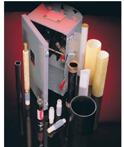
Composite materials combine structural strength with dielectric capability.